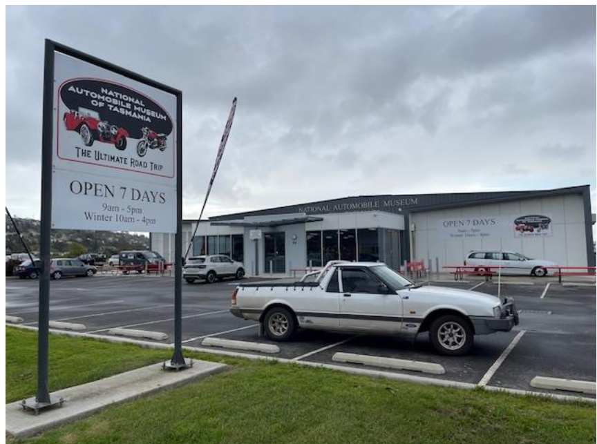
Photos of the ute in Tasmania

THE 30TH ANIVERSARY PRESENTATION PLEASE RSVP ME FOR NUMBERS ATTENDING AND CHASE UP PAST MEMBERS TO JOIN IN THE CELEBRATION