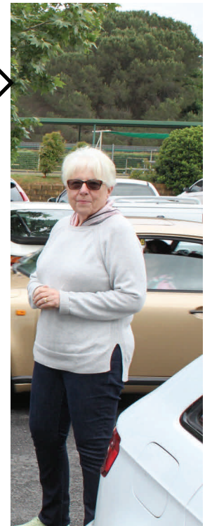
Socially distanced participants at the start