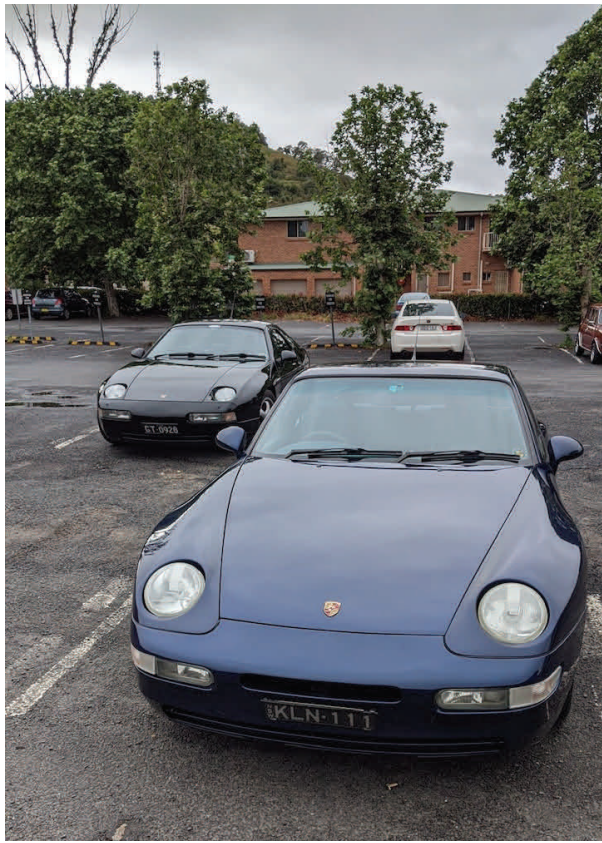
Porches socially distanced