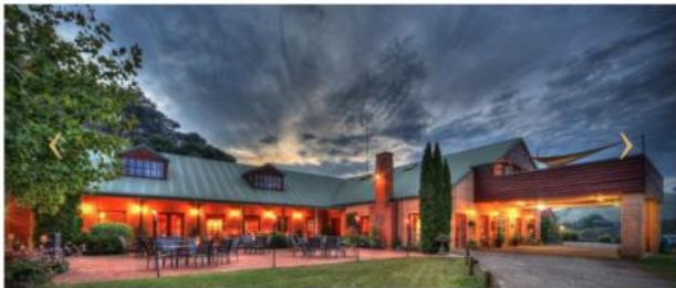
Upper Murray Function & Conference Centre

Both nights of the event will be based at the Upper Murray Resort, which features 16 two and three bedroom Australiana cottages, 4 motel style suites and a 5 room cottage with a terrific central function/conference centre. Other options are available nearby.