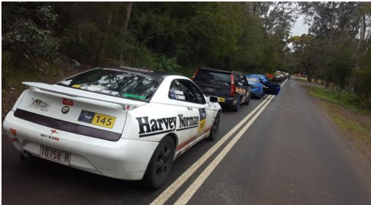
The stage start queue