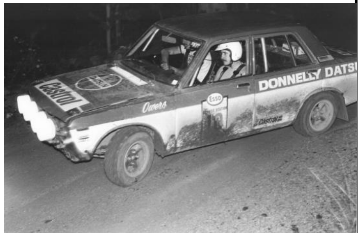
1980 ESSO Giralang