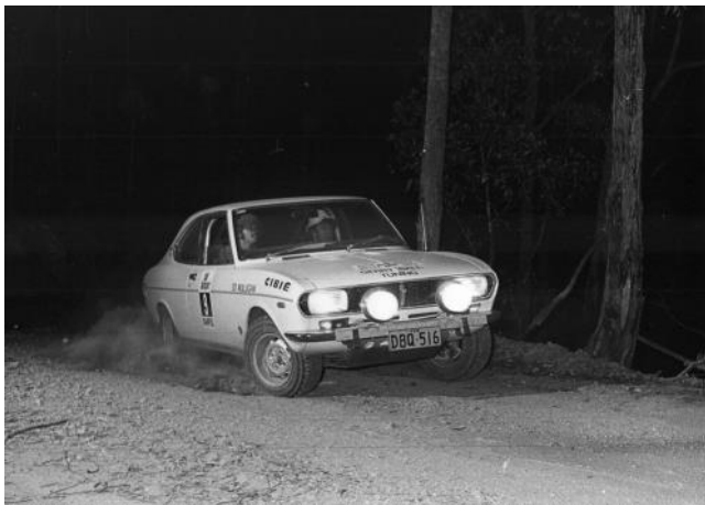
1973 Bega Valley Rally