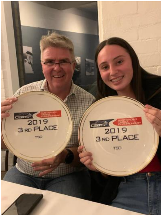
Australia Targa Championship