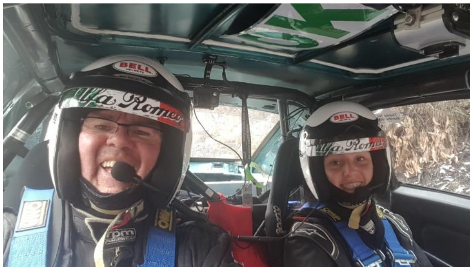
Ready to start—note the snow in the background

It turned out to be a sound decision with another strong fall of snow overnight but again, once down of the mountains the conditions, whilst wet were ok. Day 2 was going very well for us and we were up around 3rd place by lunch time. The street stage in Mansfield became our achilles heel. We're still not sure exactly what went wrong but it was probably the combination of a couple of things and it saw us drop a heap of points and plummet to 7th.