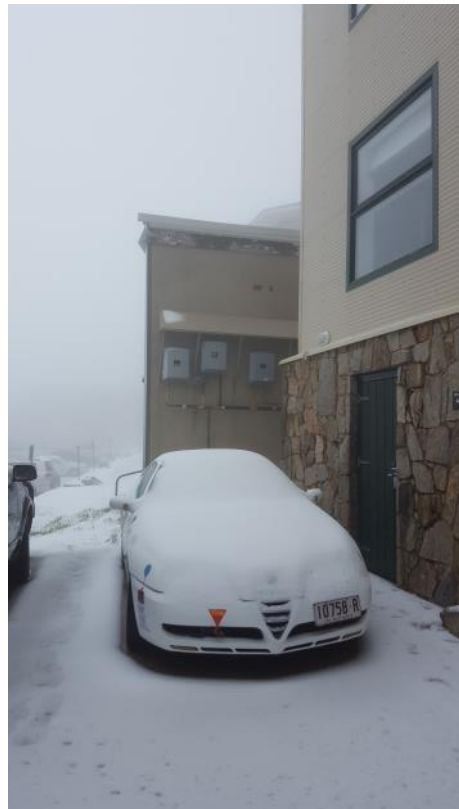
The race car on Thursday morning

Targa High Country was epic. We arrived on Wednesday not suspecting what was about to unfold. We had planned some pre-event activities for the Thursday but awoke to find not a bit of snow but a lot. We were pretty much hemmed in for the morning and there was some significant interference in scrutineering and arrival for some teams. We stayed put and did some planning (in our warm hotel room) on having to venture out for the drivers brief and welcome event.