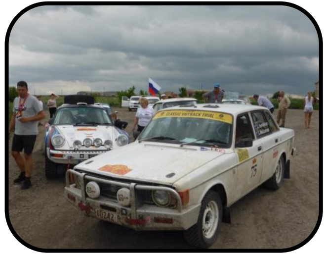
A few of the great photos from the CRC crews on the Peking to Paris endurance rally.