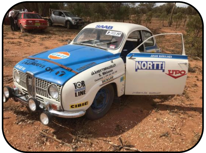
Lights were all the go on The Black Stump