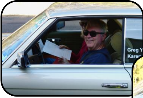
Happy starters on the Wollondilly 250