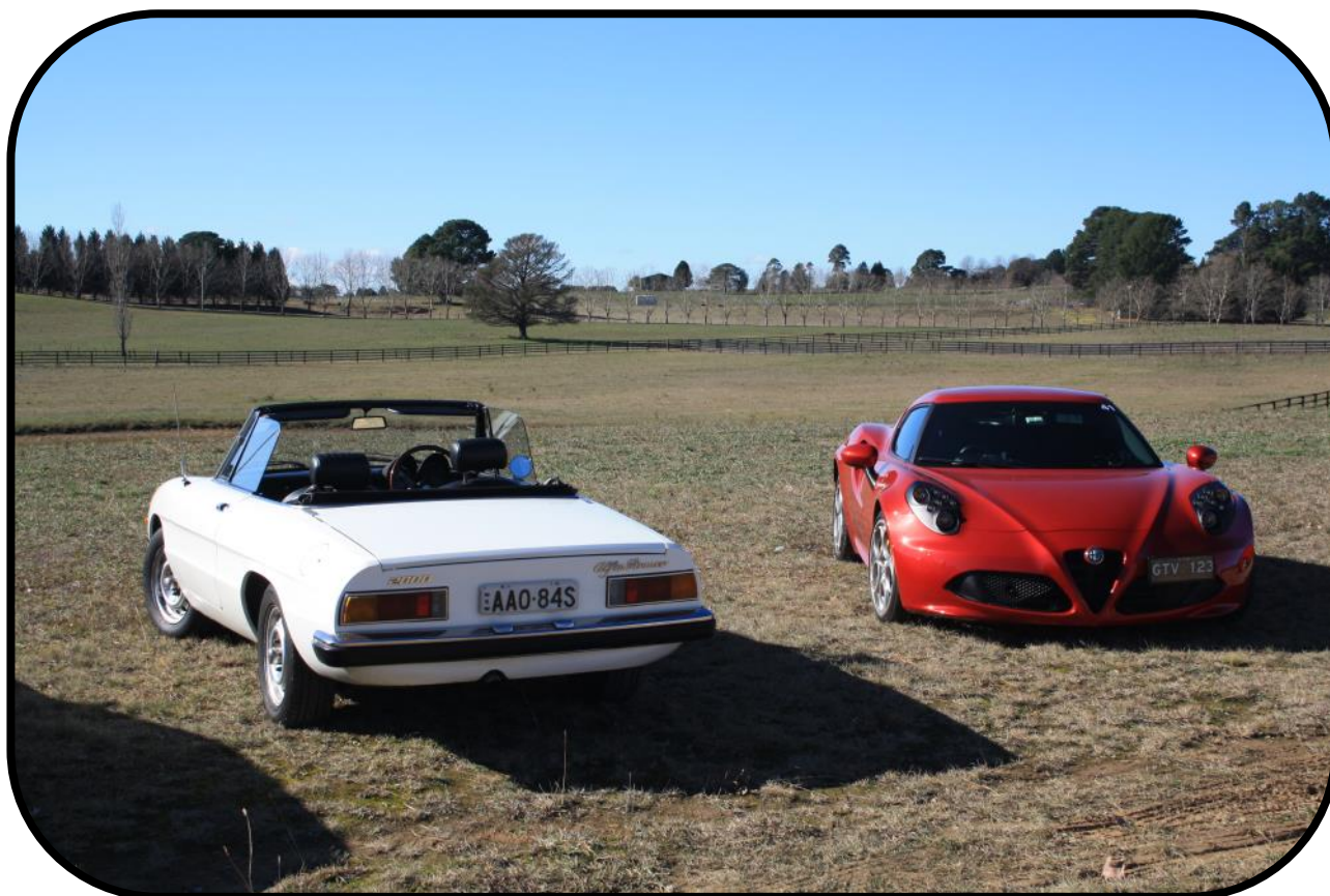
The old & the new on the AROCA Tour D' Course