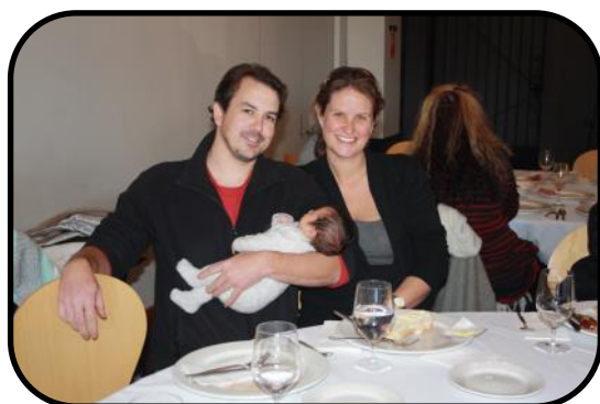
CRC people at lunch on the Tour D' Course