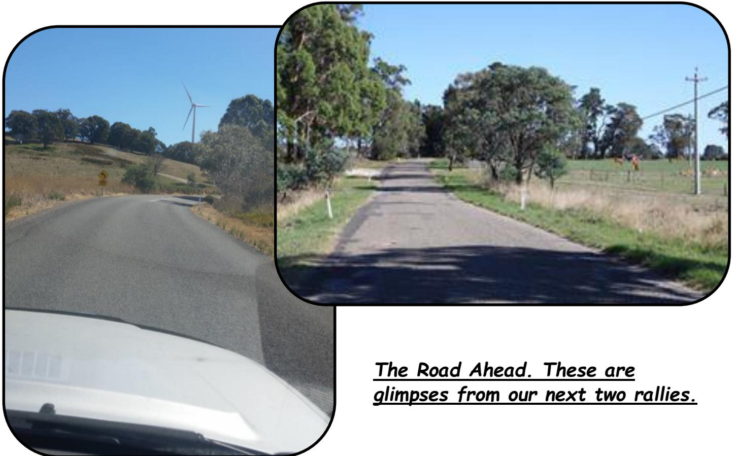
The Road Ahead. These are glimpses from our next two rallies.

April 24th - Club Meeting April 29th - The Run with No Beer.