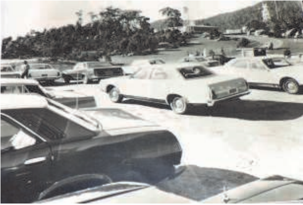
Part of the initial Press Release fleet of P76s are seen here at HoneySuckle Creek Tracking Station near Canberra.

With the success at the time of writing of the Crown/Bryson P76 in the Peking to Paris Rally, combined with the 40 year celebrations and display of the P76 at the end of June in Canberra, I have been spurred on to write my recollections of P76 ownership.