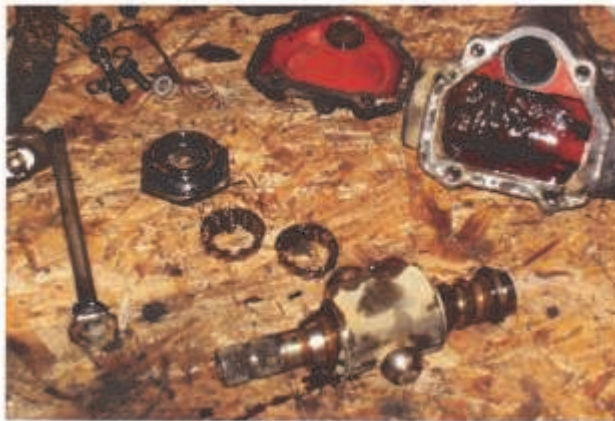
The 90-weight gear oil in this steering box is older than dirt.

On a newly rebuilt engine, this characteristic, in conjunction with the molybdenum assembly grease an experienced mechanic will use, is extremely important during the run-in period, essentially micro-machining the contact surfaces.