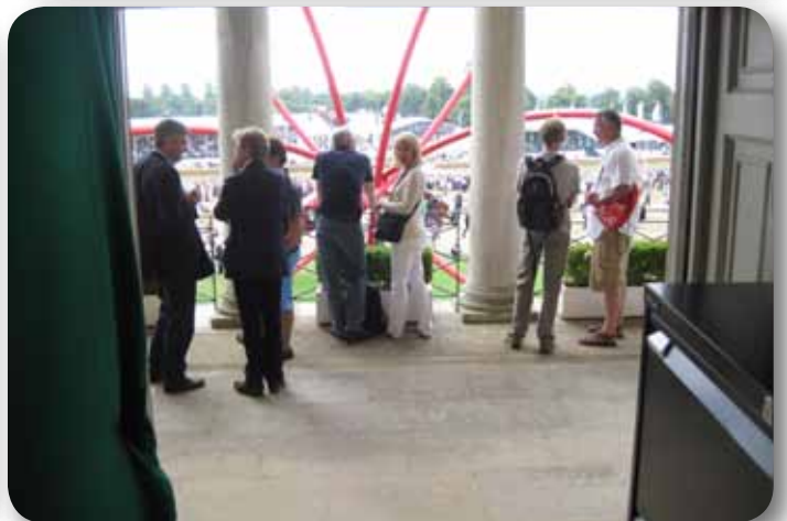
Inside and out on the balcony. And the free drinks made it extra worthwhile .