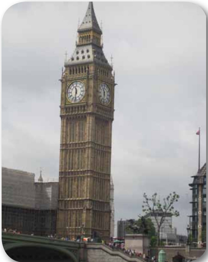
Gee ! I missed my time rallies looking forward to the Alpine Classic.