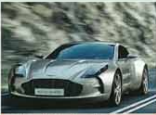
The Aston Martin One-77 will charge up the Hill in the Sunday Times Supercar Run