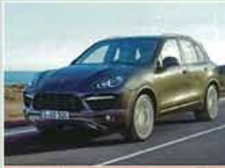
Head to the Porsche Experience area for a wild passenger ride in a new Cayenne