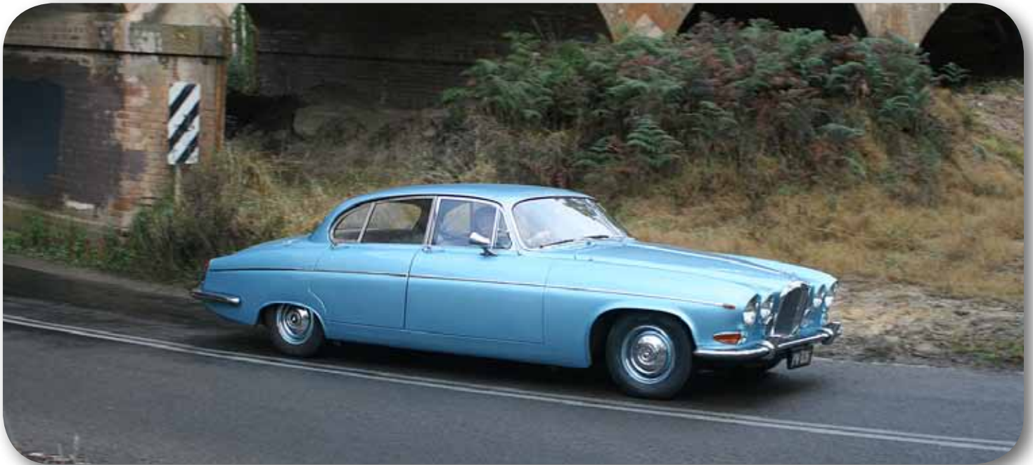
The above Jaguar 420G was judged the best presented car in the event