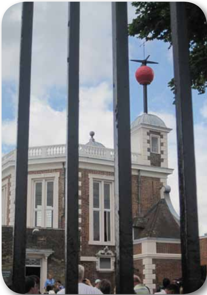
Greenwich, meantime with the ball about to drop at 1pm.