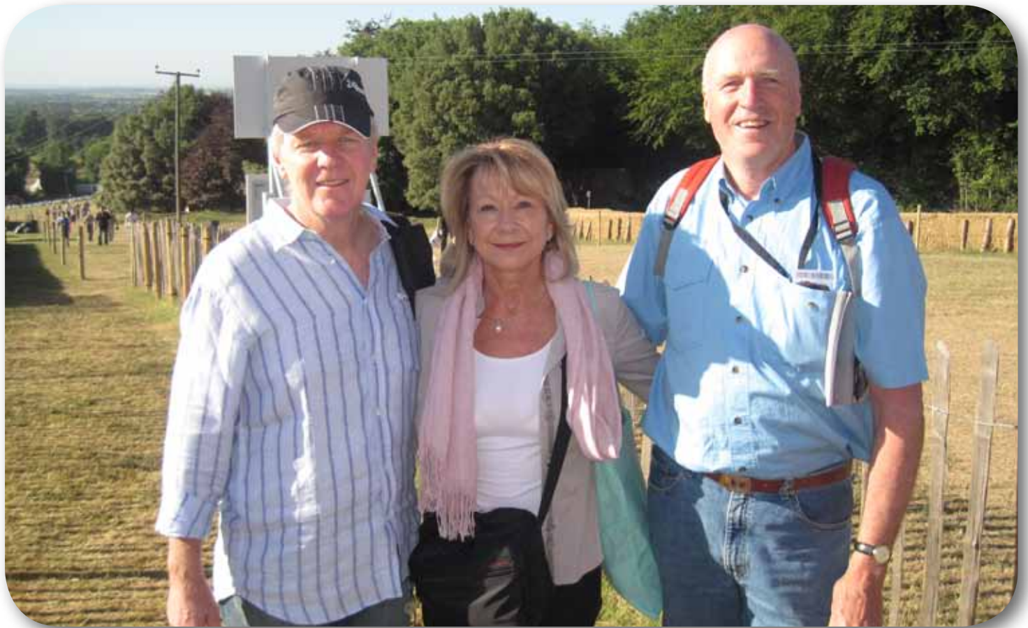
Up the hill and heading for the Rally Track.