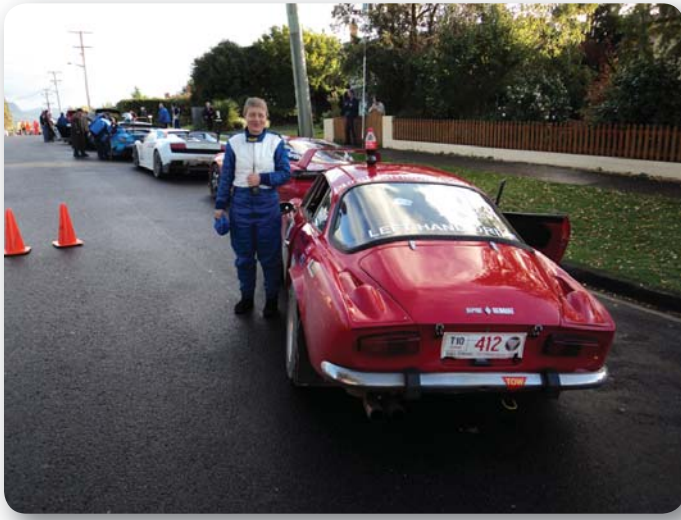
The field from behind, the white beast is the winning Lamborghini