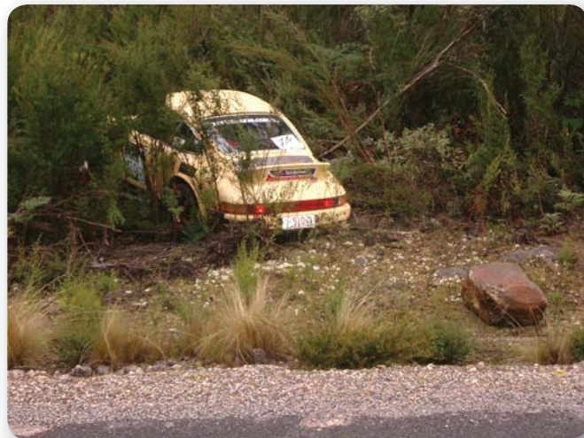
Up close with the Tasmanian wilderness, and the rock'n'roll rock.

But, I couldn't see a wet, slippery patch right at the braking point. Aquaplaned, no chance of recovery, slid straight off over an embankment, nose first into some large rocks, set one of them