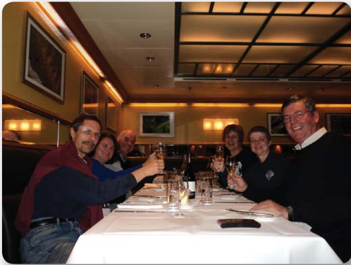
Celebrating on the way home