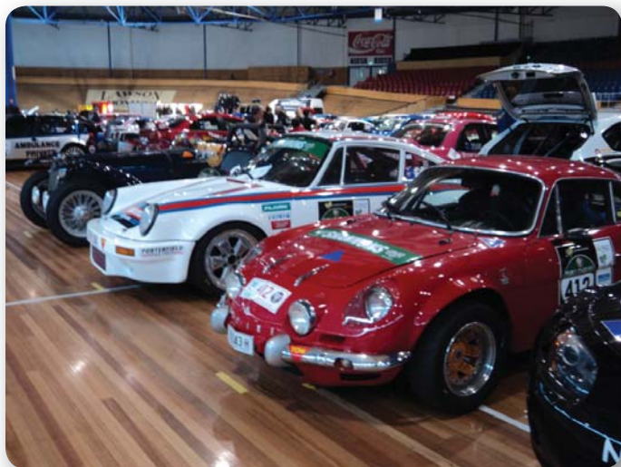
In Parc Ferme. The Delage is behind the 911