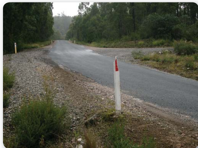
Looking back up the road. The wet glassy patch wasn't there on previous occasions!