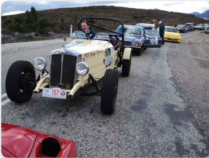
The elusive Dodge

documentation and scrutineering for the R5 Turbo and postpone ours to Monday.