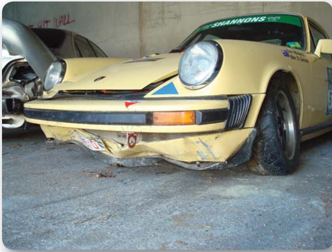
Nose looks like it's been hit by Mike Tyson. Felt like it too.

in their BMW, and even provided coffee. Both front suspension struts